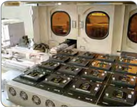
State-of-the-art 19-site programming platform

At our Global Programming Centers, we have established rigorous processes that ensure your order is completed to your satisfaction, and our sophisticated redundant systems and state-of-the-art equipment ensure reliability.