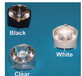
F-form optic holders (shown with optics inserted)