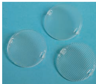
ADBACK optic sub-lenses