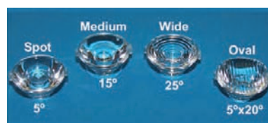
F-form optic sub-lenses