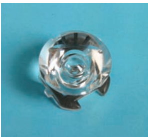
ADBACK optic base

CL COMMERCIAL LIGHTING FL FLASHLIGHTS TR TRANSPORTATION BL BACKLIGHTING SI SIGNAGE